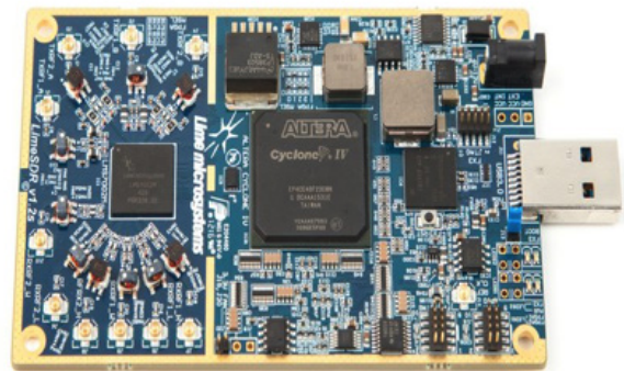
LIME SDR PLATFORM

An expected topology is automatically generated and is then used as a baseline from which anomalous activity can be identified